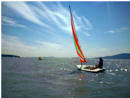
Sailing to windward on Bellingham Bay.

Students will pass US Sailing certification guidelines, and have the opportunity to keep sailing with weekly dinghy races and relaxed weekend sailing activities through the Junior Sailing Club, and participate on the Junior Racing Team.